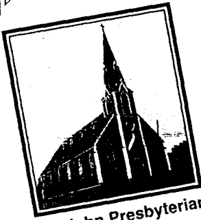
St. John Presbyterian